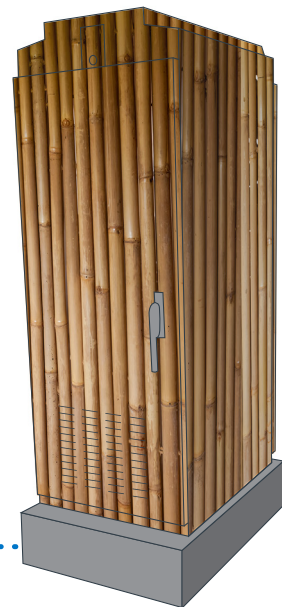
BAMBOO & MORE!